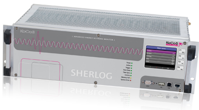
Fig. 1: SHERLOG CRX front view