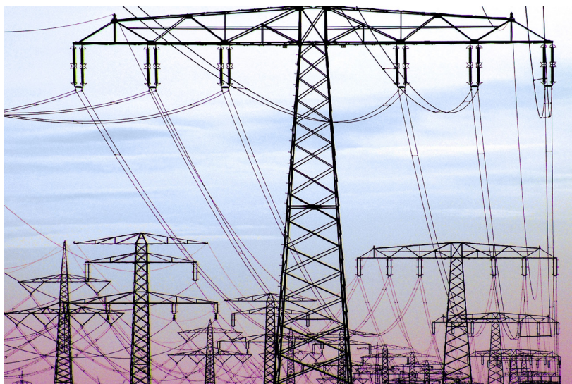
Fig. 3: Pylons

For integration in substation control and protection or for the exchange of data with systems from other manufacturers, SHERLOG CRX can use a range of data protocols, including IEC 61850 and Modbus. Access to the measurement data can be afforded to a number of different users or systems simultaneously. This means that SHERLOG can be integrated within an IEC 61850 host system, for example,