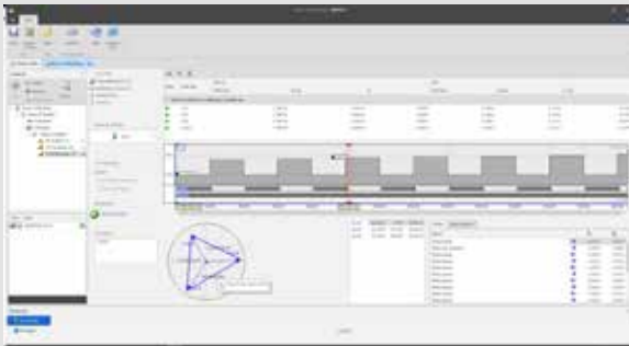
ARTES 5: PIC-Monitor

For documentation and, if necessary, submission for certification, the test results can be automatically compiled into a test report. The content of this report can be defined by selecting the available test results.